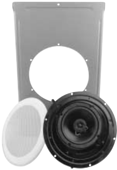
FA62T-8MB Shown in FA97-8 Enclosure, with FA720-8 Grille and FA81-8 Tile Bridge